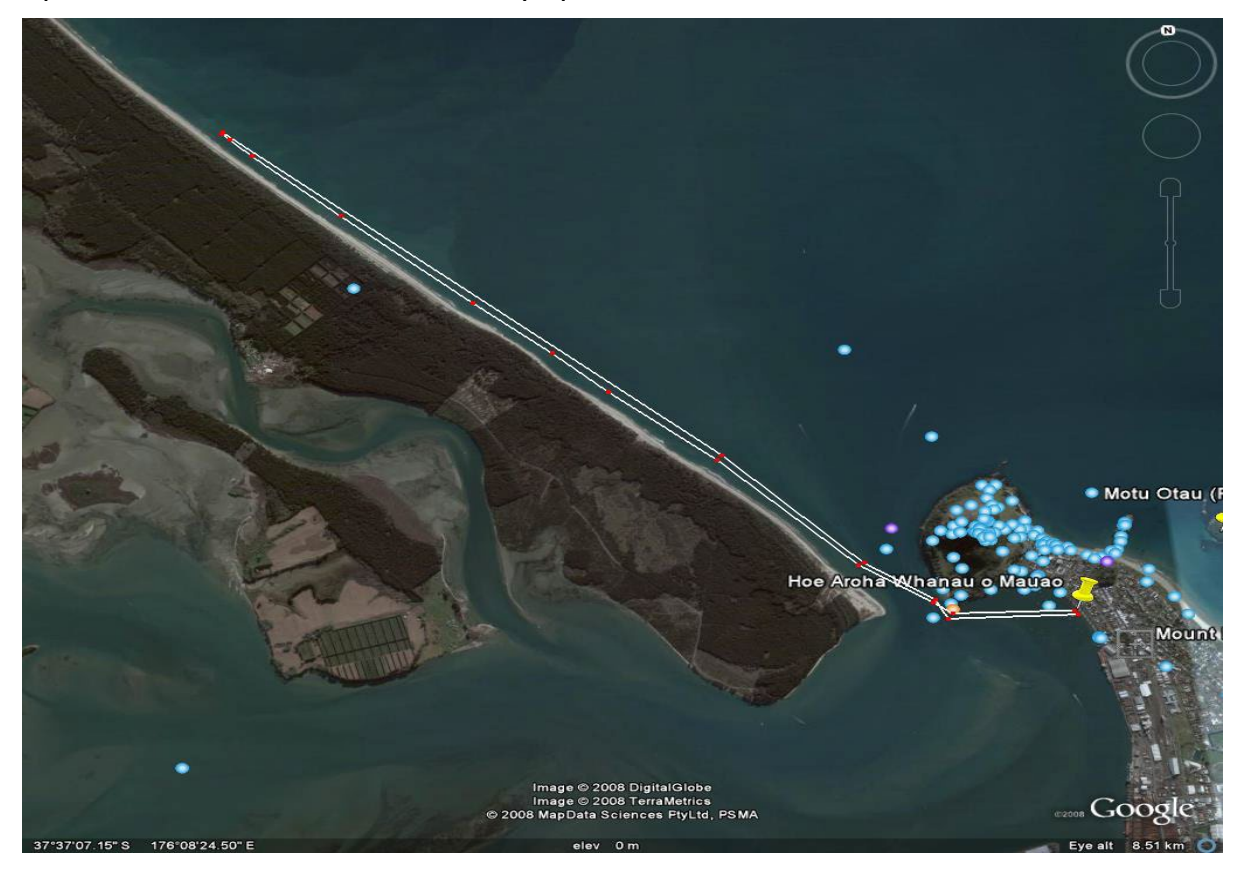
Option 3 – W1/W2/W3/J19/Novice 10km Course – Pilot Bay up Matakana Surf Side Return