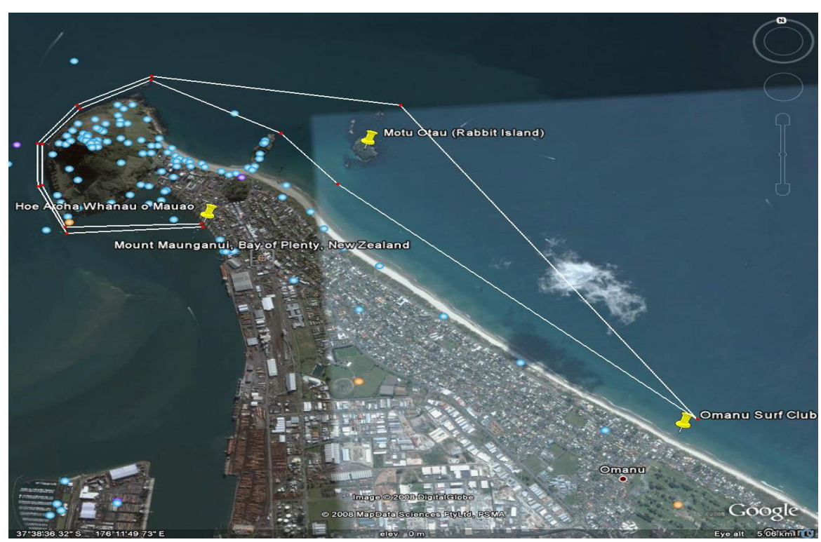
Option 1 - W1/W2/W3/J19/Novice 10km Course - Pilot Bay to Motu Otau Return